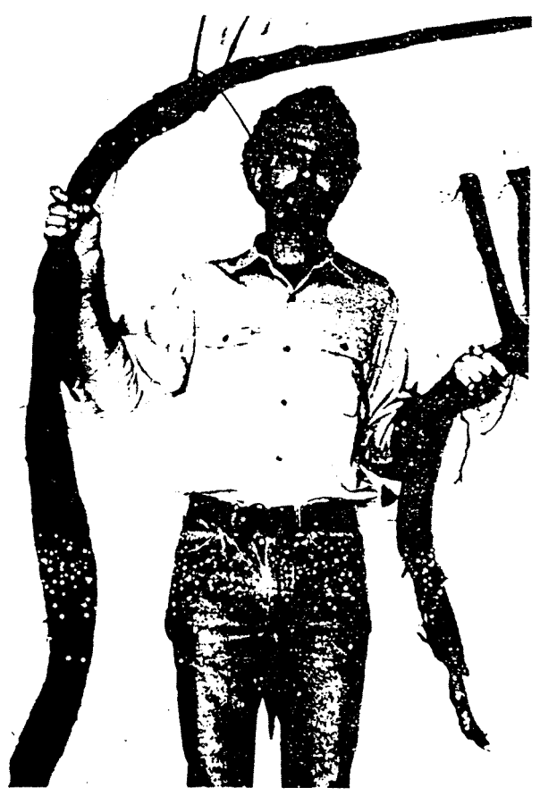
Roots of tree-draped kudru in the Piedmont.

China, Taiwan, Japan, and India. The species naturalized in the southern U.S. is Pueraria lobota (Willd.) Ohwi. This species originated in China and moved to other cultures by way of Japan and Korea. The early Chinese made a root tea which they used for treating fever, influenza, dysentery. and even insect bites. Cloth and paper were made from kudzu vine fibers as early as 1665. Japan imported the plant during the 1700s to make cakes from the root starch. The Japanese have continued using kudzu as a food ingredient and today it is a million dollar business. It is harvested for use as an extract powder to thicken sauces, to flour fried foods, and in making cakes and candies. In 1976, 40,009 packets of kudzu powder were imported and sold in the C.S. A U.S. harvesting and processing plant has been considered by entrepreneurs.