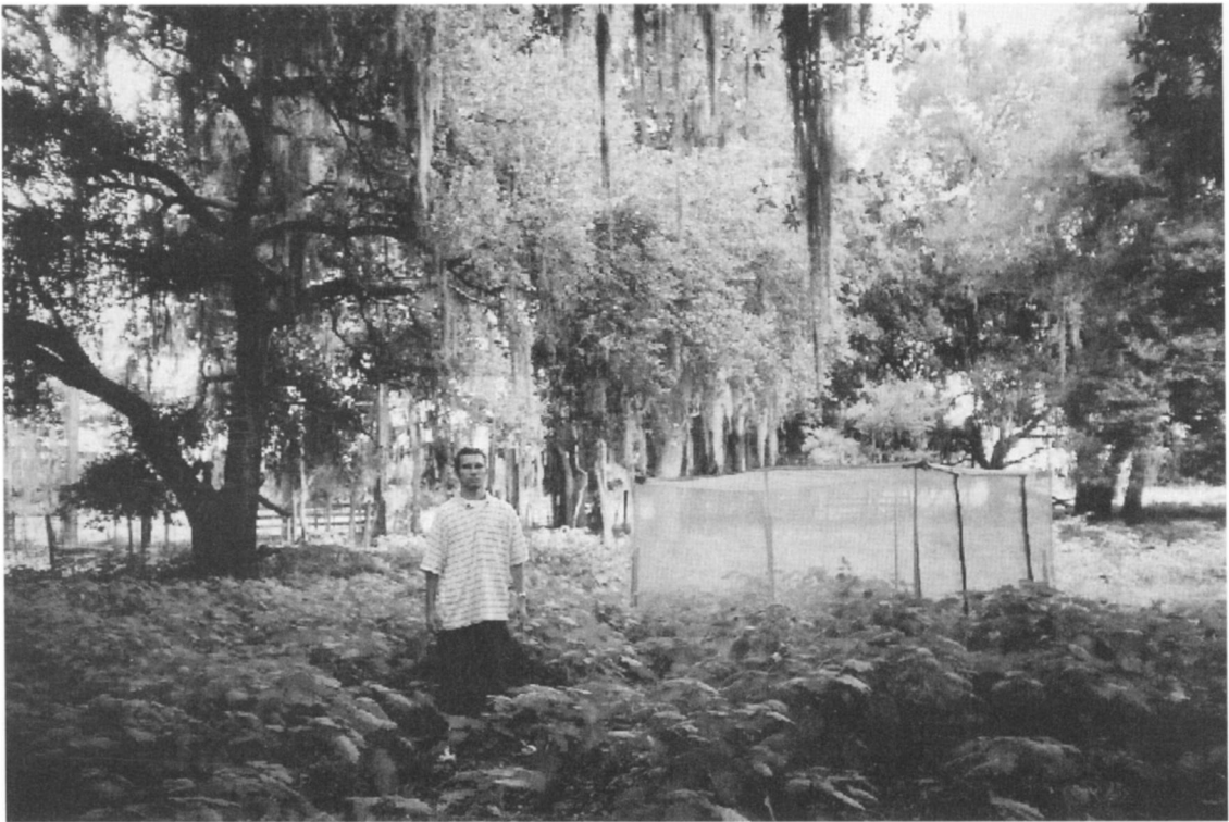
Fig. 3. Tropical soda apple stand before Gratiana boliviana beetles were released. Tropical soda apple covered 100% of the surface. Polk County, Florida, USA, May 2003.

abundance of potential predators at the release sites such as the green lynx spider, Peucetia viridans (Hentz), observed preying on adult beetles, and the red imported fire ants, Solenopsis invicta Buren, observed preying on small and large larvae, this biocontrol agent was capable not only of surviving but of rapid population increase and dispersal to target plants elsewhere. The most likely explanation for the relatively low numbers (average <5 per plant) of beetles recorded on the 20 marked tropical soda apple plants during 2005 was due to the beetles' dispersal from the initial release site to tropical soda apple plants as far as 1,600 m away observed in Sep 2005. Dispersal of the beetles can be attributed to the lack of tropical soda apple foliage caused by the beetle feeding on the target plant since they were released in the previous growing season. Dispersal ability of G. boliviana adults is similar to that of other chrysomelids monitored in weed biocontrol programs (Grevstad & Herzig 1997; DeLoach et al. 2007), or even greater (1.6-16.0 km/year) as indicated by dispersal assessment conducted throughout Florida since 2003 (Medal et al. 2008; Overholt et al. 2009, 2010).