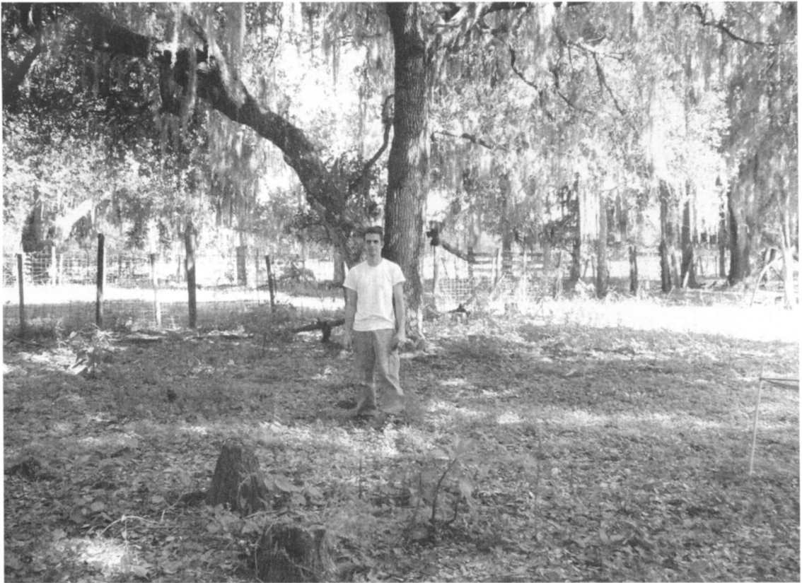
Fig. 4. Site of former Tropical soda apple stand in Polk County, Florida, USA in April 2008. In Aug 2003 Gratiana boliviana beetles had been released at this site. During the intervening yr tropical soda apple coverage of the surface was reduced to 0%.

South Africa for managing the non-native invasive plant Solanum sisymbriifolium Lam. A South-American leaf-feeder beetle, Gratiana spadicosa (Klug) (Coleoptera: Chrysomelidae), released in South Africa in 1994, became established; however, its effect on the target weed has not been as successful as G. boliviana on tropical soda apple in Florida due to different biotic (predation), abiotic (climate), and management (burning regimes) factors at the release sites in South Africa (Olckers 1996; Byrne et al. 2002).