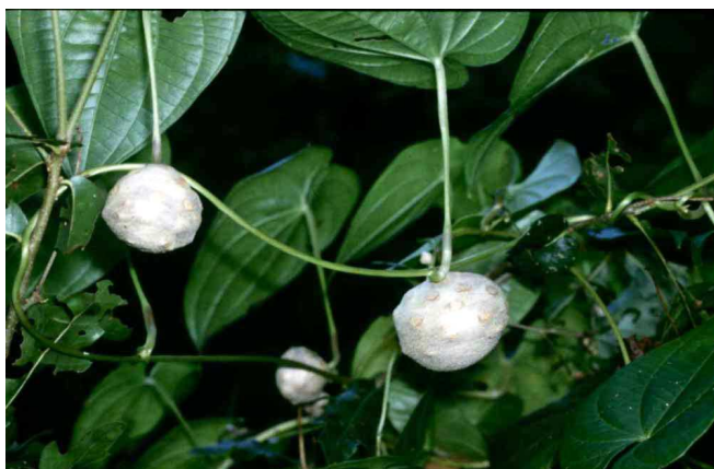
Figure 2. Air potato bulbils form in leaf axils.