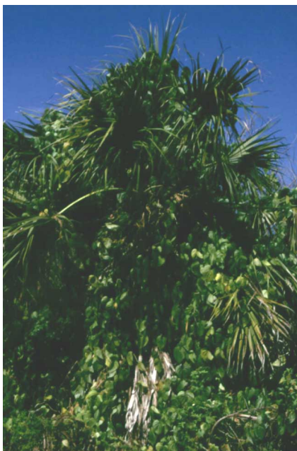
Figure 1. Air potato vine engulfing native cabbage palm.