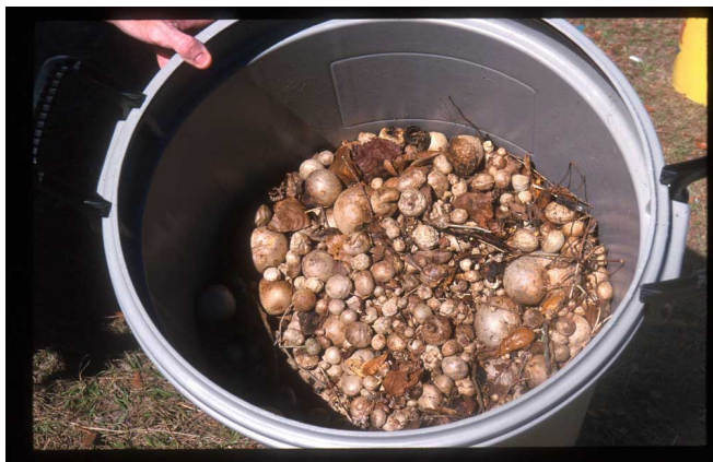
Figure 7. Remove air potato bulbils and other plant material from site and dispose of in such a way that they do not spread the vines to new areas.

As many bulbils as possible must be removed from the site (Figure 7). Those which remain will produce new vines. All plant material including bulbils must be disposed of in such a way that they do not spread the vines to new areas; for example, in a landfill where they will be incinerated. Plants become dormant in winter (during short day-length). Locating and removing bulbils is easier during winter months when air potato and other vegetation are not as dense as during summer. Air potato bulbils cannot tolerate freezing, and overnight in a freezer is the best way to prevent them from starting new infestations.