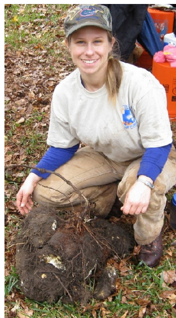
Figure 6. Underground tuber of winged yam.

vegetation, or the applicator. Try to spray at a time when there is no wind, such as early morning. If there is a slight breeze, applicators should position themselves upwind of the air potato to avoid herbicide drift back. If the sprayer has an adjustable tip, a larger droplet size and a straight stream may help to minimize drift and overspray. When mixed with desirable plants, the air potato vines may be pulled onto the ground and sprayed.