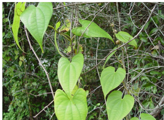
Figure 5. Side-by-side comparison of winged yam (left) and air potato (right).

give good results with some selectivity to avoid damaging desirable plants. It is important to cover the foliage as thoroughly with herbicide as possible. Spray the leaves just to the point of run-off because spraying more wastes herbicide on the ground. Spray as many leaves as possible, and as high as the sprayer can reach. However, be careful not to overshoot the target and splatter herbicide on surrounding