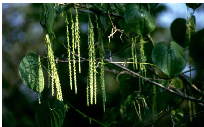
Figure 4. Air potato flowers.

give good results with some selectivity to avoid damaging desirable plants. It is important to cover the foliage as thoroughly with herbicide as possible. Spray the leaves just to the point of run-off because spraying more wastes herbicide on the ground. Spray as many leaves as possible, and as high as the sprayer can reach. However, be careful not to overshoot the target and splatter herbicide on surrounding